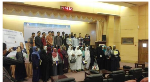
Workshop attendees gather for a photo at the close of a successful training.

The certificates are accredited by both the Saudi Commission for Health Specialties and the Sudanese Health Council.