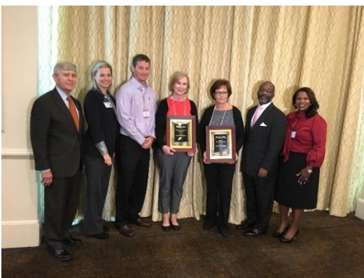
Highest Overall Performance winner, The Family Doctors in Shreveport, with BCBLA senior staff

Awards were presented as part of Blue Cross’ annual QBPC Statewide Collaborative on Thursday, Nov. 2, 2017, in Baton Rouge, La.