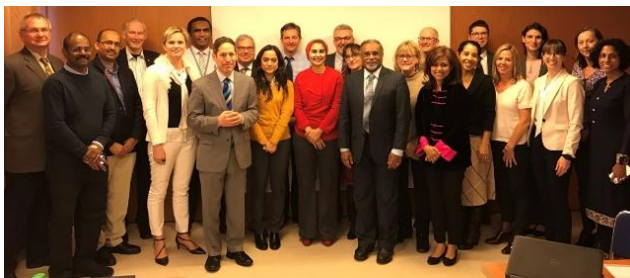
Global Hearts Initiative partners meeting in Geneva, March 15-16, 2018.

on a global scale by strengthening primary care health systems to prevent heart attacks and strokes.