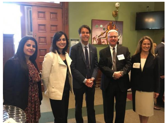
Minister of Health Dr. Eric Hoskins among the Hypertension Canada team at their Queen's Park Lobby Day, for World Hypertension Day 2017

initiatives for health care professionals who treat hypertension.