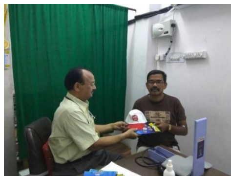
Participating clinician offers a “Salty Six” cap and literature to a patient