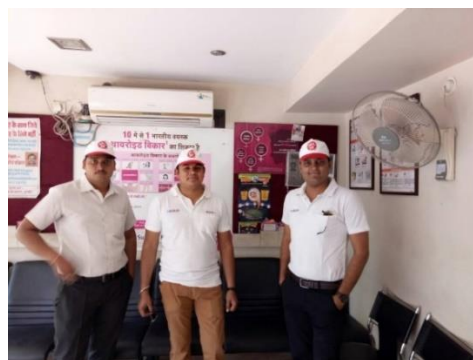
Sodium/Salt poster: Excess Salt is poison

Patient pamphlets were distributed in regional languages about hypertension and foods to avoid. Theme-based print materials were given to healthcare providers across India to increase hypertension awareness. We targeted approximately 10 million of India’s population through this activity.