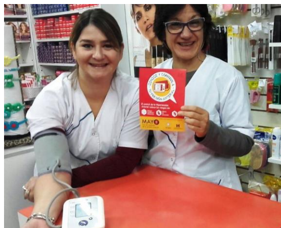
"Know and Control Your Blood Pressure"

important repercussions for our Society. For more information and photos from our campaign, please visit our facebook page: https://facebook.com/conoceycontrola/