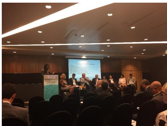
Panel Session at the WHF 2 nd Global Summit on Circulatory Health in Singapore, July 12-13, 2017