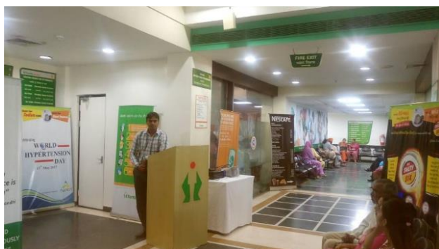
Banner showing the AHA theme “Salty Six” in the local (Punjabi) language