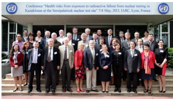
Conference Participants on the Semipalatinsk Test Site May 2013, Lyon, France

The International Agency for Research on Cancer (IARC) is coordinating the EU-funded project SEMI-NUC. The project aims to test whether a long-term epidemiological study in the area adjacent to the former Semipalatinsk