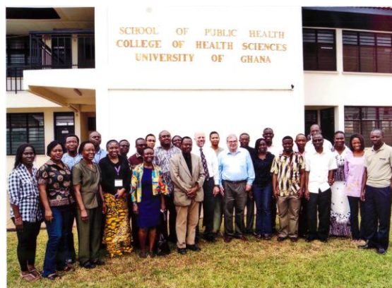
Group Picture: 2 nd Week of the Research Course for the Inaugural Cohort of Trainees at University of Ghana, Accra.