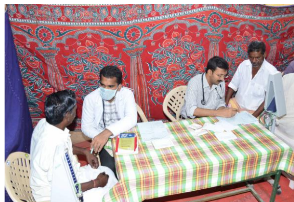
Blood Pressure Screening