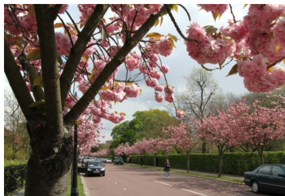
Flowerage Beyond the ESH Meeting

I came away from the meeting feeling we still need radically new approaches to drug therapy and importantly, better methods for translating knowledge about lifestyle, obesity and cardiovascular disease into practice for prevention and management at a population level. The latter is critical not only for countries with incomes scarcely able to afford vaccination programs, and some European countries with hospitals currently unable to afford bandages or pharmacies to stock drugs, but also for the wealthiest countries with health budgets blowing out at a time when the obesity epidemic has the potential to cripple even the wealthier economies. However sometimes it is the most basic and apparently obscure research that leads to the major breakthroughs benefitting everyone on the planet. So let us continue with a multipronged approach to obtaining, disseminating and applying new knowledge on a broad front with maximum interchange of ideas between those in the frontline of health care and backroom scientists. Such features were exemplified by this European meeting, and, we can anticipate further opportunities at the forthcoming ISH Scientific meeting in Sydney with its broad international representation, its unique welcoming style, not to forget including an innovative WHL/APSH/ISH breakfast workshop " Research on a Shoestring ".