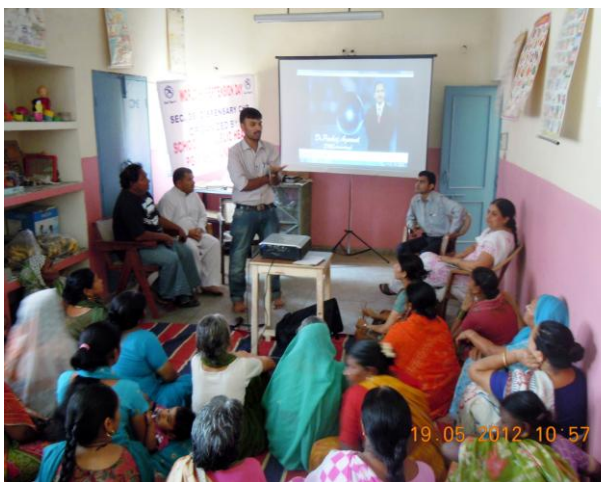
Community Based Awareness and Screening Program

Short movies in local language (Hindi) were projected and explained by the resident doctor then and there. The residents pointed out the sedentary lifestyle, eating habits are the reason for new diseases of present generation which is indirectly due to advancing technology. They were explained about the DASH diet and physical activity in terms of duration, frequency and severity. The complications caused by high blood pressure and early reporting of health facility in case of danger symptoms explained. Issues raised by the group were rectified by the resident doctor.