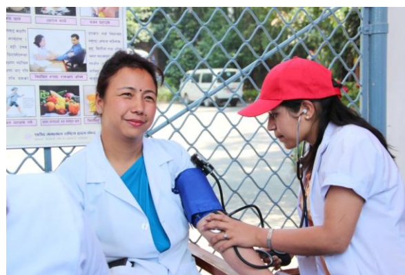
Matron of SGNHC at program