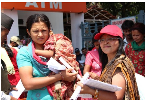
Health Education Material Distribution at WHD 2012

Among the hypertensive participants, more than half of the participants were not aware of their status. They were diagnosed for the first time. About one fourth of the hypertensive participants were aware that they had hypertension but they had not done anything to manage it. Likewise, 16.66% of hypertensive participants were taking medicines but were not in control. Only 7.15% of them were taking medicine and are also in control.