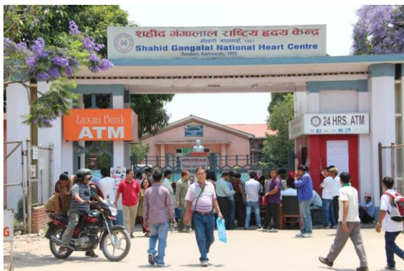
Venue: Shahid Gangalal National Heart Center, Nepal