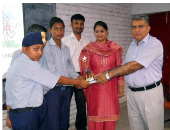
First Prize Distribution