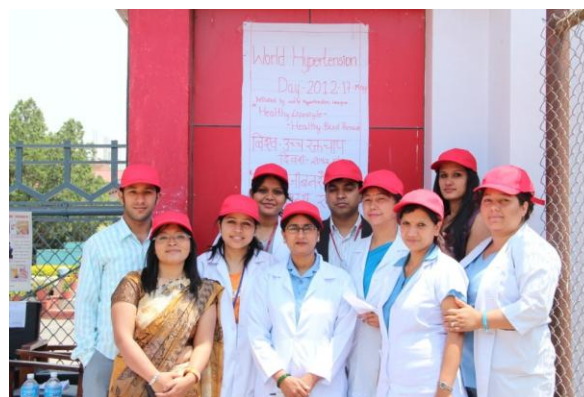
Program Crew of Nepal's World Hypertension Day

However it is a small scale program, it can be considered as a symbolic program to raise awareness in hypertension. About one third of the participants were found to be hypertensive, which is clearly showing that blood pressure is rising in urban community. In addition, awareness, treatment and control level is really poor. One day is of course not enough to control and prevent hypertension, we must consider this day as a beginning day to do lots of awareness program in future and for a whole year.