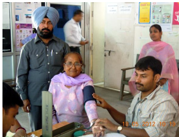
Facility Based Screening Program

On the second day, facility based screening for Obesity, Hypertension and Diabetes were conducted. Out of 56 patients 14 were pre-hypertensive and 22 were hypertensive. All patients were weighted and their height was measured and BMI calculated. 13 patients were pre-obese and 2 were in obese category. Likewise for diabetes, 8 patients were with impaired blood sugar (advised Glucose Tolerance Test) and 7 were diabetic. Short movies about the need for life style change, regular checkup of blood pressure and reporting to health personnel/ facility in case of complications (cardiovascular, retinovascular and cerebrovascular) were projected and explained. Individual dietary counseling was also provided. Issues raised by the patients were clarified then and there.