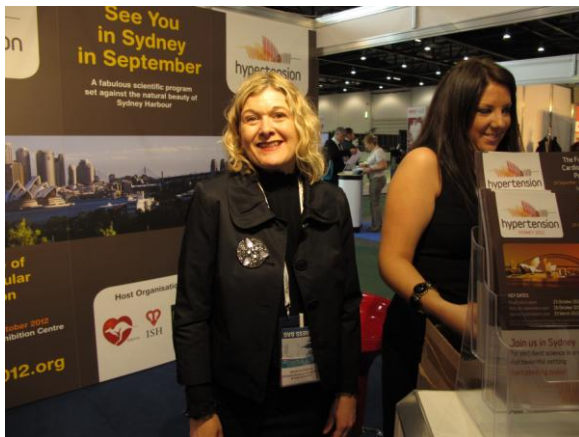
ISH Stand at ICC London, UK

This April ESH Scientific meeting seems to have come and gone with the speed of an Olympic runner. It was a large meeting, held in the new conference centre in Docklands which functioned well and offered ample opportunity for exercise in reaching the centre or moving between sessions. As we are accustomed to expect from ESH, the meeting included an excellent selection of speakers and younger investigators presenting reviews and original work on a range of topics relating to hypertensive cardiovascular disease. One of the frustrations for attendees of meetings where there can be dozens of parallel sessions on overlapping topics is not knowing what you have missed and whether you made the right choices. This difficulty is compounded by the lack of hard copy of oral abstracts which used to be able to skim through during the day as the online abstracts are not likely to be read during the meeting (they are available as a pdf document on www.esh2012.org/ ) Nevertheless there was plenty to whet the appetite in both oral presentations and well run poster sessions. One of the major benefits of meetings such as this is the opportunity to catch up with colleagues and friends and make new contacts and collaborations. Even this is best done better in the smaller workshops sessions and satellites of which there was abundance at this meeting.