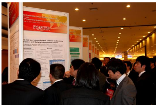
Congress Participants at the Poster Area