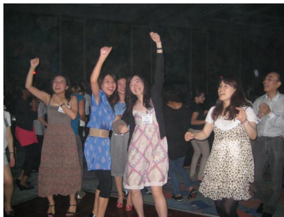
Participants enjoying the ‘Salute to American Cultures’ reception

The social highlight of the meeting was a “Salute to American Cultures” reception which featured performances from the dance group Liquid Rhythms followed by music for everybody to dance to.