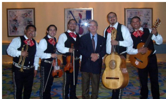
Liquid Rhythms dance group

To encourage participation from new investigators, the sponsoring societies provided over 40 new investigator travel awards to trainees, fellows and new faculty.