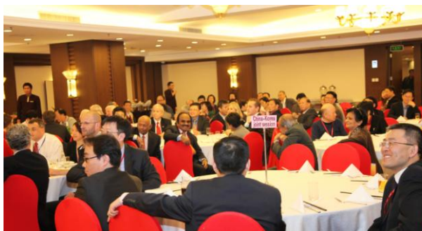
Participants at the Faculty Banquet

More than 2,000 scientists and clinicians attended the Congress representing the east and west hemispheres of the world. The meeting provided a superb opportunity for scholarly exchange with 55 debates and case presentations, 34 symposia, 54 oral presentations and 331 poster presentations. The meeting also provided a forum for the establishment of international collaborations. A critical function of the World Hypertension League is bringing together the member societies, and the 2011 Congress was a success in that regards.