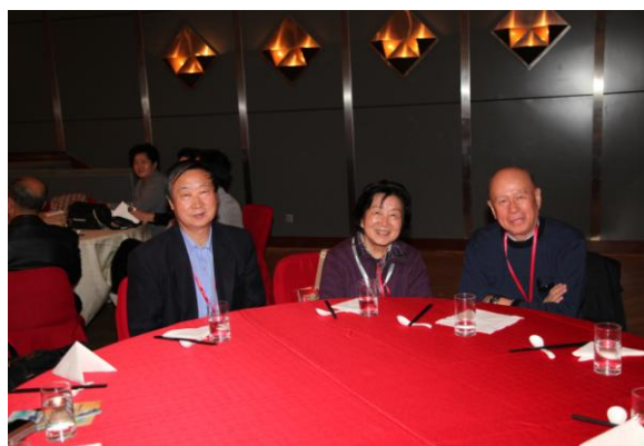
Scientists at the Plenary Sessions