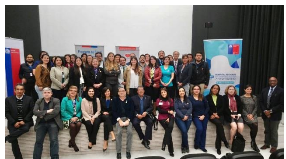
Antofagasta Visit Group photo

Programs and activities to address the increasing cardiovascular disease burden, especially cardiovascular risk factor detection, prevention, and reduction, as well as detection and control of hypertension, are rapidly expanding in Latin America and the Caribbean during 2018.