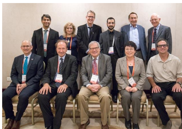
World Hypertension League Executive and Board