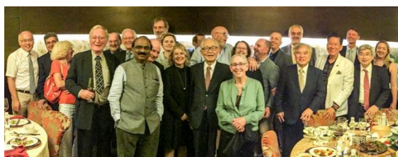
WHL and ISH enjoy Beijing collegiality.