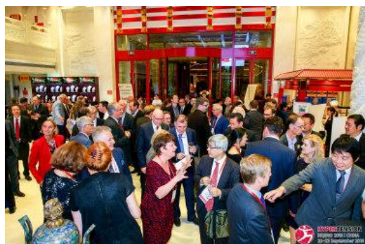
Conference guests enjoy the Presidential Reception and Dinner in Beijing.

With almost 3000 registered participants, Hypertension Beijing 2018, the 27 th Meeting of the International Society of Hypertension (ISH), held in cooperation with the Chinese Hypertension League and the Asian Pacific Hypertension Society, was a great success. The scientific programme comprised 99 sessions with a total of 657 oral presentations and a further 934 poster presentations for a total of 1951 abstracts. The faculty was truly international: 323 faculty members came from 43 countries. The high scientific quality of the congress, with its balance between basic and clinical science as well as public health and population science, and incorporation of participants from all continents, was unanimously acknowledged.