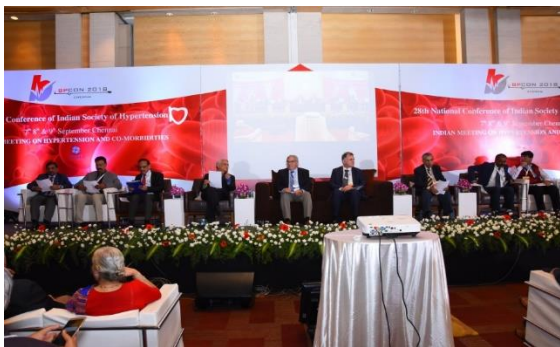
The Inauguration Ceremony of BPCON 2018 hosts many illustrious guests.