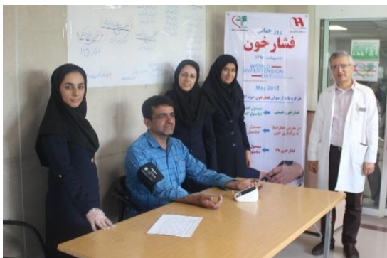
The Isfahan Hypertension Research Center team