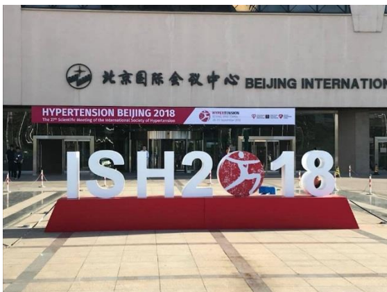
ISH Attendees are welcomed at the entrance to the Beijing International Conference Center.