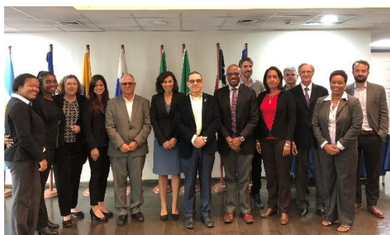
Santiago, Chile, Group photo

Masterclasses are also planned for November 2018, to train all staff at the clinical primary care sites. In addition, a highly successful site visit recently took place in Chile. Members of the PAHO and WHO, CDC, consultant advisors, and governmental and community leadership met in Santiago, Chile in September of this year. National and local control rates of hypertension have dramatically increased. In addition the site visit included a formative visit to Antofagasta in northern Chile where significant expansion of the program has now been planned and is being implemented. Due to success of the program and local and national positive results, formal agreements are now solidified with Argentina, Ecuador, Panama, and Trinidad-Tobago. A formal site visit to initiate the HEARTS in the Americas Program and to review the HEARTS Technical package is already scheduled for Ecuador and Trinidad-Tobago in late November and Panama and Argentina in early December this year.