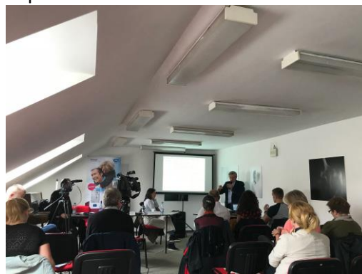
Press Conference in Bratislava

*Implement changes in the health insurance companies' approach to the lifestyles of their insured persons, to allow for reimbursement of health care expenses that promote lifestyle improvement.