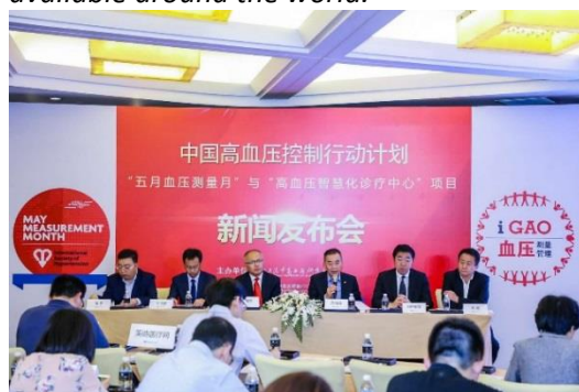
MMM holds Press Conference in China.

Professor Neil Poulter, President of the International Society of Hypertension (ISH), states: “We know we can often reduce blood pressure (BP) with lifestyle changes and existing drugs, but unless people know they have hypertension they can’t be treated. Our key objective is therefore, not only to increase public awareness, but also to collect the evidence needed to help influence global health policy and make BP screening more widely available around the world.”