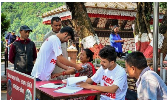
MMM Nepal Community Outreach

The results of MMM17 were published on the eve of World Hypertension Day 2018 in a Lancet Global Health paper . The paper reported analyses of the data from over 1.2 million screenings in relation to many factors including gender, age, lifestyle and location, but there are still many more questions to answer. We hope MMM18 data will help to generate more information and raise awareness even further.