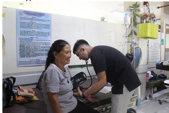
Blood Pressure screenings at BRTTH

In celebration of Hypertension Awareness Month and in commemoration of the centennial year of the Bicol Regional Training and Teaching Hospital, a simultaneous Hospital-Wide Blood Pressure Screening was conducted on May 17, 2018. An extension of the advocacy of our Hypertension Clinic, the activity aimed to screen for blood pressure in at least 100 participants for one hour in the morning and afternoon. Ten hypertension kiosks were set up in hospital departments, staffed by medical interns/ clerks and supervised by department residents-in-charge. A total of 359 personnel, ambulatory patients and visitors were screened for hypertension. Seventy-six (21%) were noted to have BP \geq 140/90, hence advised to have BP monitoring and workup upon follow-up at the OPD Hypertension Clinic.