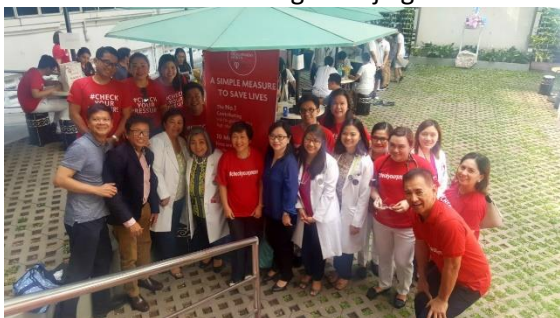
Philippines MMM18 Hypertension Screening

Early indications suggest the number of countries taking part in MMM18 will exceed the eighty that contributed to the campaign in 2017. BP screening has taken place across many regions, cultures and in diverse screening locations, for example hospitals, community centres, schools, supermarkets, pharmacies, markets, temples and factories. The collection and analysis of MMM18 data is now underway, with the hope of releasing the results in September during the ISH Biennial Scientific meeting in Beijing.