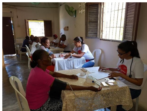
Dominican Republic MMM activities