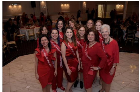
AHA/ASA Go Red Ambassadors - 2017 Northern New Jersey Go Red For Women Luncheon

The American Heart Association is having another successful year in their crusade to build healthier lives, free of heart disease and stroke. Founded in 1924, the American Heart Association is the nation's oldest and largest voluntary health organization, dedicated to helping to prevent, treat and defeat heart disease and stroke - the two leading causes of death in the world. The Association teams with millions of volunteers to fund cutting-edge research, fights for stronger public health policies, conducts lifesaving public and professional educational programs, and advocates to protect public health.