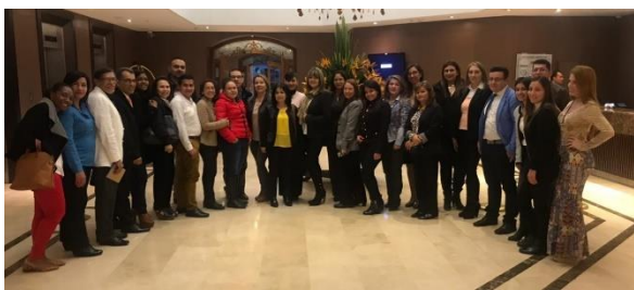
Conference leadership gathers for a group photo.

PAHO is leading the detection and treatment of hypertension and this effort is now approaching its fifth anniversary. This effort started as the Standardized Hypertension Treatment Program and quickly expanded to the Cardiovascular Risk Reduction through the Hypertension Control and Secondary Prevention Program, and now has recently been renamed the HEARTS in the Americas aligning with the Global Hearts Initiative of the WHO and CDC. The success of the initial demonstration sites in Barbados, Chile, Colombia, and Cuba has led to the rapid expansion of the program within each country. More importantly, the success of these initial and bold efforts has resulted in the recent announcement that Panama and Ecuador will implement the program. Additional countries in Latin America and the Caribbean have expressed genuine interest in joining the program and active discussions are currently underway.