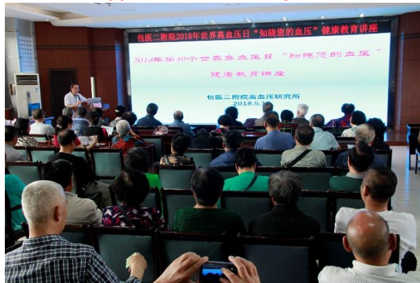
Inner Mongolia (above), Shanxi (below) and Gansu (2nd photo below) engage in outreach activities during World Hypertension Day 2018 in China.