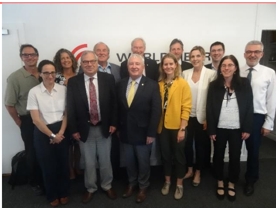
Group photo from the Global Coalition meeting during WHA71.