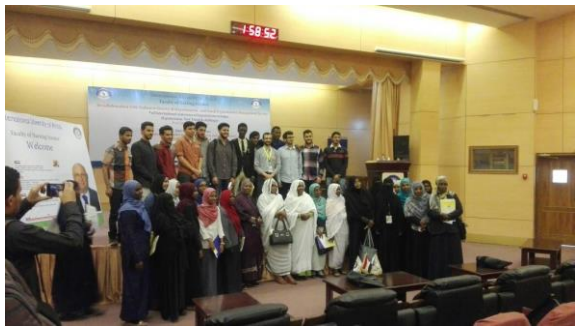
Workshop attendees gather for a photo at the close of a successful training.

The certificates are accredited by both the Saudi Commission for Health Specialties and the Sudanese Health Council.