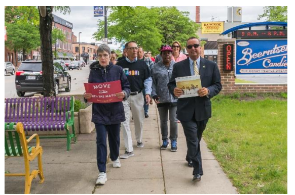
Green Bay workers and residents join Mayor Jim Schmitt to raise heart health awareness before a Move with the Mayor walk through downtown.

MWTM provides mayors a platform to promote active lifestyles and start or strengthen a healthy culture change in their cities. Through MWTM, mayors encourage their citizens to take literal steps to improve their health by walking, since it is one of the easiest ways to lower one's chances of heart disease and its risk factors, like high cholesterol, high blood pressure, and diabetes.