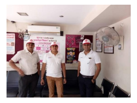
Sodium/Salt poster: Excess Salt is poison

Patient pamphlets were distributed in regional languages about hypertension and foods to avoid. Theme-based print materials were given to healthcare providers across India to increase hypertension awareness. We targeted approximately 10 million of India's population through this activity.