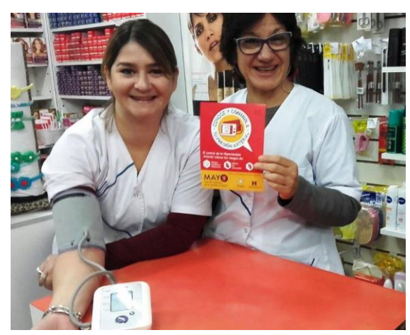
"Know and Control Your Blood Pressure"

important repurcussions for our Society. For more information and photos from our compaign, please visit our facebook page: <a href="https://facebook.com/conoceycontrola/">https://facebook.com/conoceycontrola/</a>