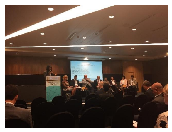
Panel Session at the WHF 2<sup>nd</sup> Global Summit on Circulatory Health in Singapore, July 12-13, 2017

Cardiovascular and circulatory disease community to create a Global Coalition to end needless deaths from the world's number one killer: