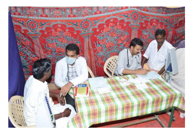
Blood Pressure Screening

Hypertension Screening Camp in Tamilnadu, India