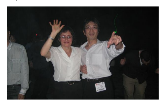
continued on page 6