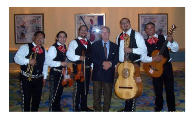
Liquid Rhythms dance group

To encourage participation from new investigators, the sponsoring societies provided over 40 new investigator travel awards to trainees, fellows and new faculty.